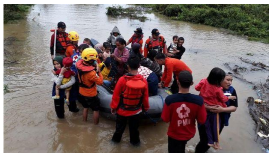
Evacuation process in North Konawe, Southeast Sulawesi, (ANTARA FOTO/HumasSAR