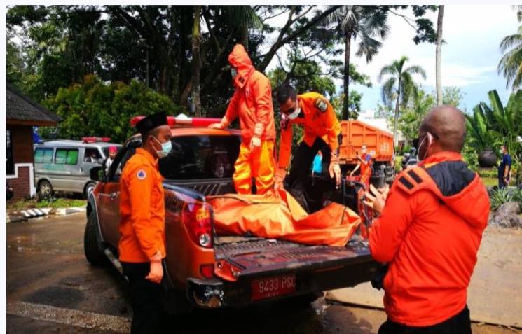
Search and Rescue Operations.