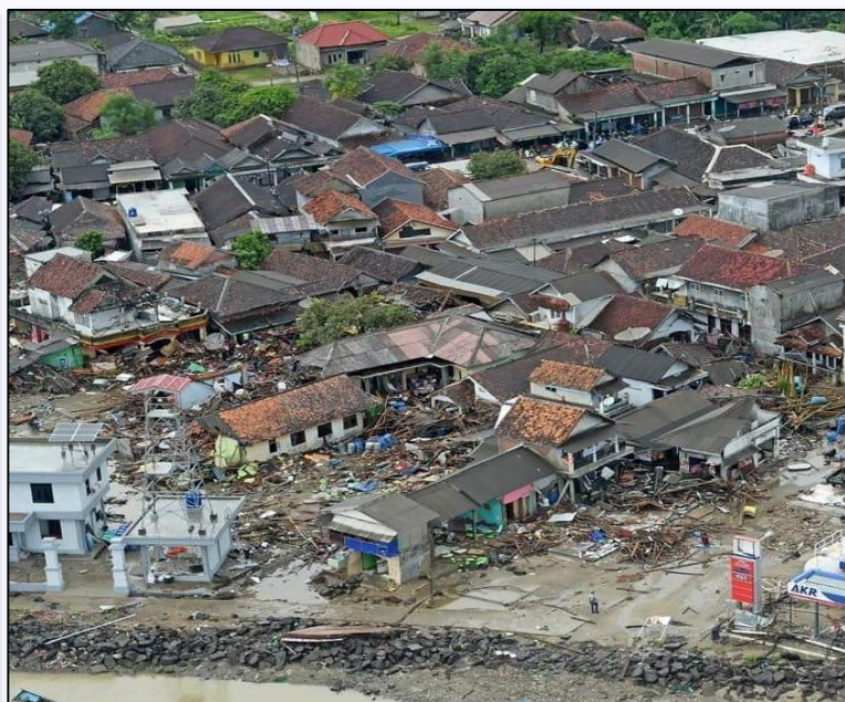
Aerial pictures of the Tsunami affected areas in Pandeglang District.