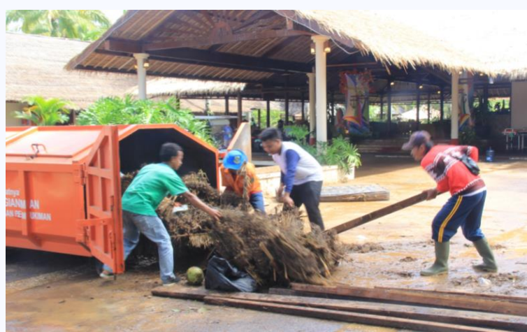
Power network restoration (left), and debris cleaning (right).