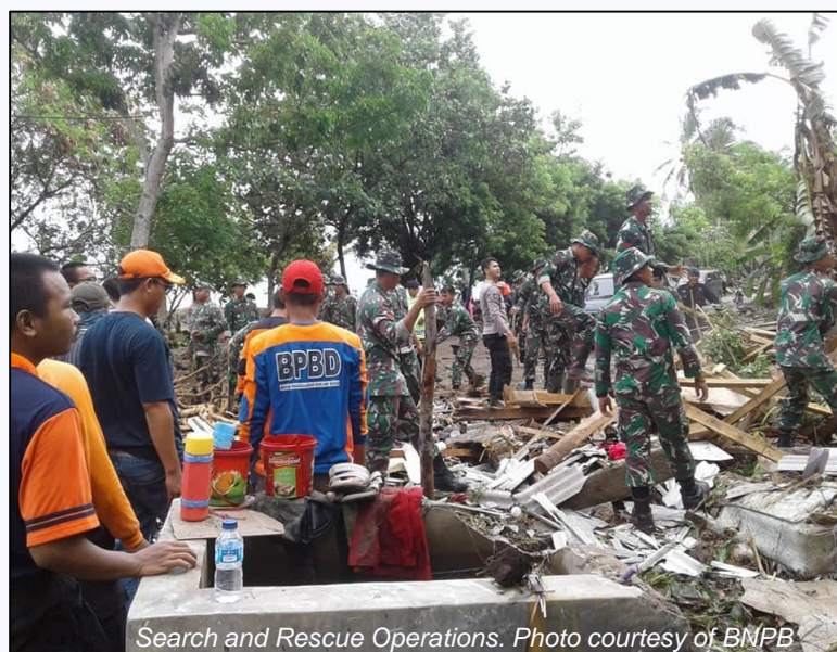
Search and Rescue Operations.