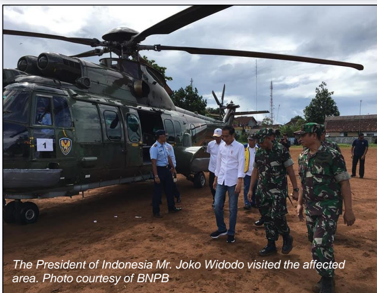
The President of Indonesia Mr. Joko Widodo visited the affected area.