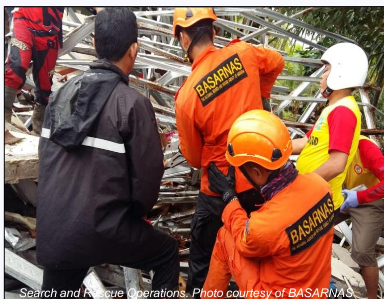
Search and Rescue Operations.