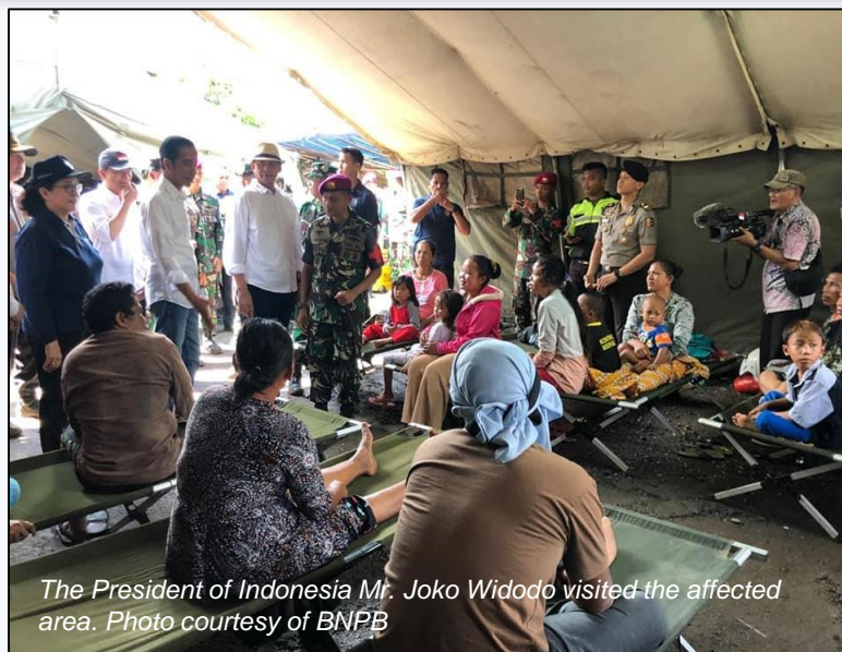
The President of Indonesia Mr. Joko Widodo visited the affected area.