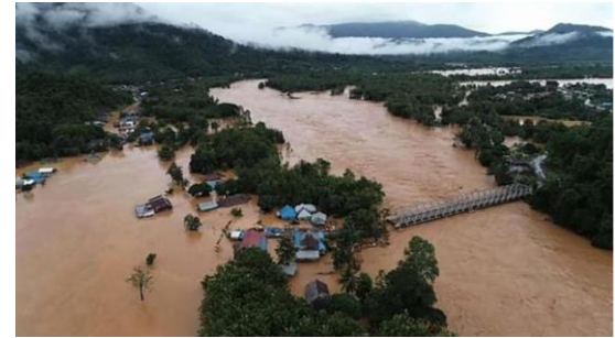
Flooding in Southeast Sulawesi.