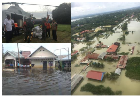
Flooding in Konawe Regency, Southeast Sulawesi.