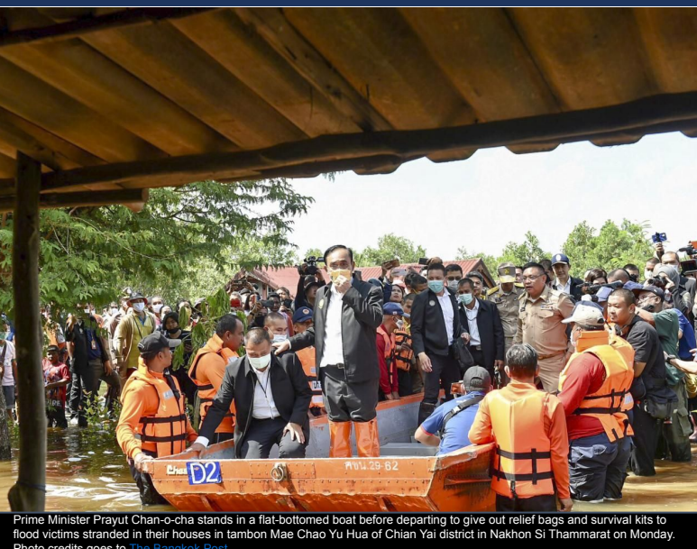
Prime Minister Prayut Chan-o-cha stands in a flat-bottomed boat before departing to give out relief bags and survival kits to flood victims stranded in their houses in tambon Mae Chao Yu Hua of Chian Yai district in Nakhon Si Thammarat on Monday.