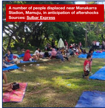
A number of people displaced near Manakarra Stadium, Mamuju, in anticipation of aftershocks

Disclosure(s): Estimations are based on data reported/confirmed by National Disaster Management Organisations of the respective ASEAN Member State (Badan Nasional Penanggulangan Bencana) and other verified sources