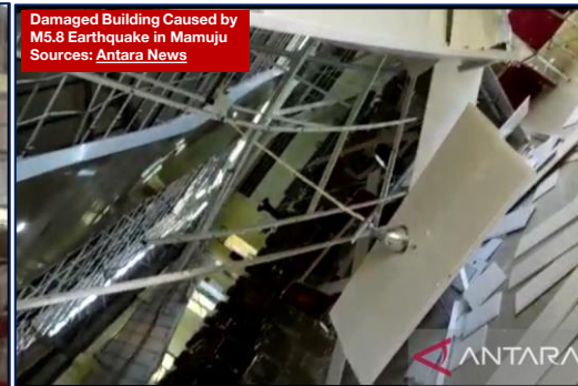
Damaged Building Caused by M5.8 Earthquake in Mamuju