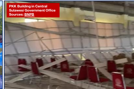
PKK Building in Central Sulawesi Government Office