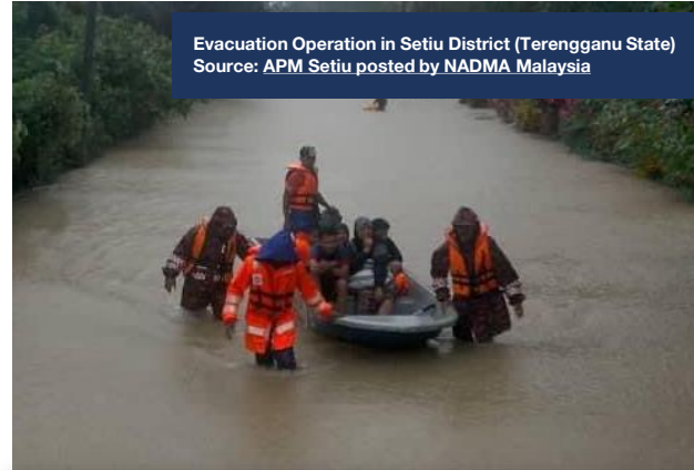
Evacuation Operation in Setiu District (Terengganu State)