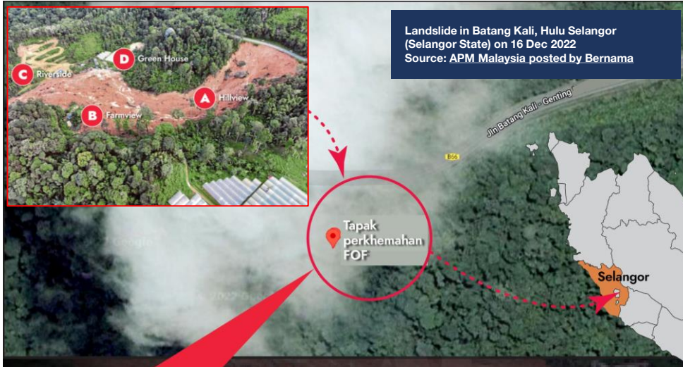
Landslide in Batang Kali, Hulu Selangor (Selangor State) on 16 Dec 2022