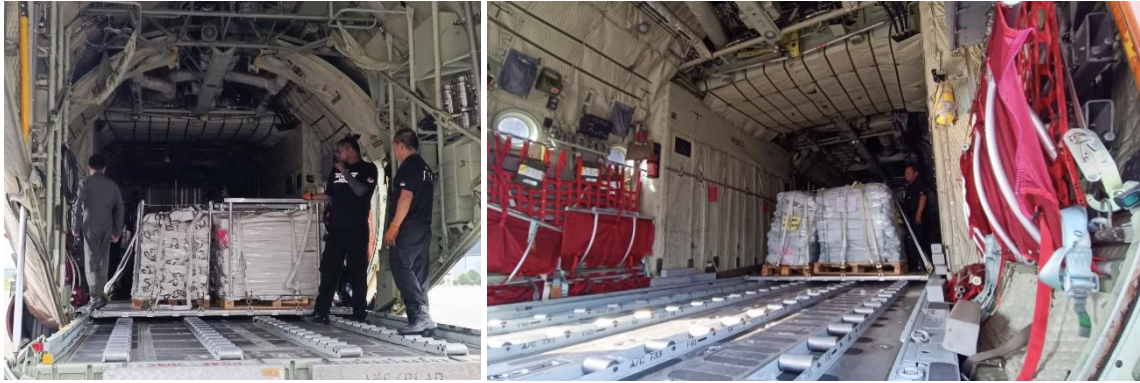
Annex 1. DELSA relief items arrived in Myanmar on 21 May (left) and 22 May (right)